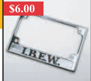
Motorcycle Tag Frame

100% cotton, rugged blue denim, with embossed IBEW initials on front and 10" embossed logo on back.