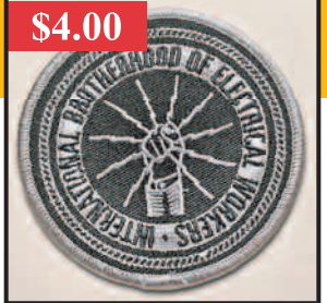
Black & Silver Logo Patch

3" embroidered IBEW cloth patch made of 100% nylon twill. Designed to be used on motorcycle vests.