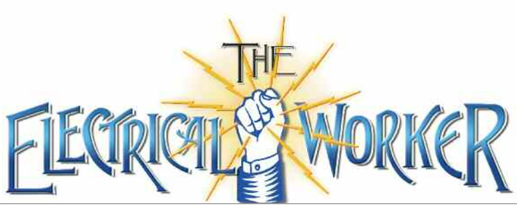
International Brotherhood of Electrical Workers

The Electrical Worker was the name of the first official publication of the National Brotherhood of Electrical Workers in 1893 (the NBEW became the IBEW in 1899 with the expansion of the union into Canada). The name and format of the publication have changed over the years. This newspaper is the official publication of the IBEW and seeks to capture the courage and spirit that motivated the founders of the Brotherhood and continue to inspire the union's members today. The masthead of this newspaper is an adaptation of that of the first edition in 1893.