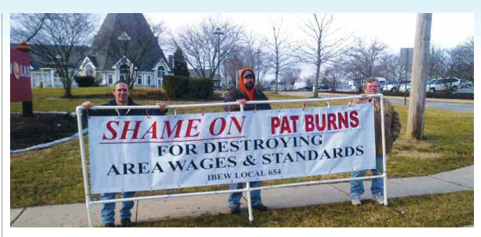
IBEW Local 654 bannering against destruction of wages and standards on Springfield Marriott Hotel project.