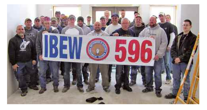
Local\,596\ members\ volunteer\ on\ Chestnut\ Mountain\ Range\ project.