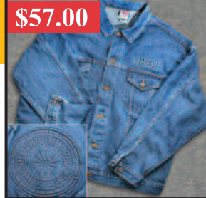
Embossed Denim Jacket

3" embroidered IBEW cloth patch made of 100% nylon twill. Designed to be used on motorcycle vests.